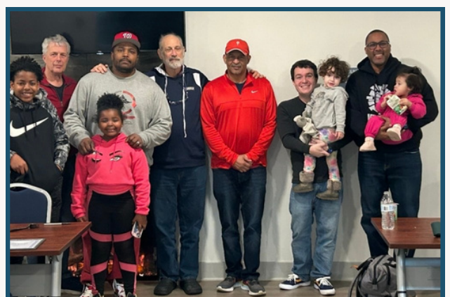
WINTER '23 - West Chester, PA