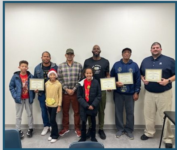
FALL '23 - Phoenixville, PA

The fall Foundations of Fatherhood workshop triumphed as participants came together over the past eight weeks, acquiring invaluable insights and knowledge. This program curated an enriching experience, cultivating personal growth and fortifying the bonds of fatherhood through thoughtfully structured sessions.